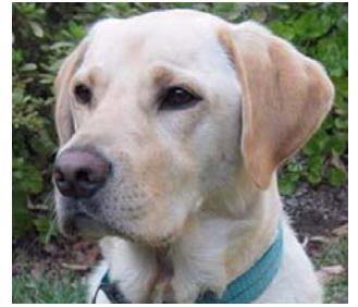
New! Reference Retriever

RefViz leaves no stone unturned, making your research as relevant and thorough as possible.